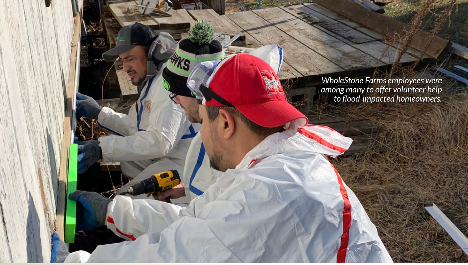
WholeStone Farms employees were among many to offer volunteer help to flood-impacted homeowners.