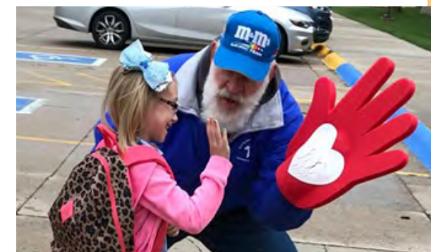
A record 1,856 donations were given during the 2019 Big Give!

Join us again this year! And thank you for helping make good work better!