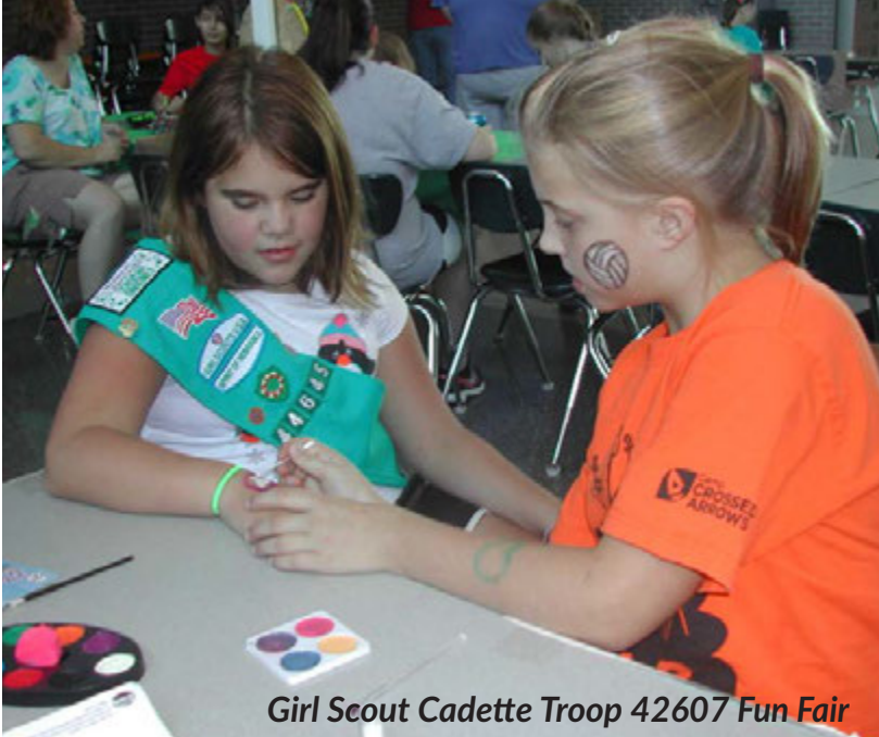
Girl Scout Cadette Troop 42607 Fun Fair