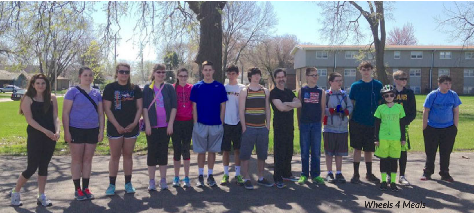
Wheels 4 Meals