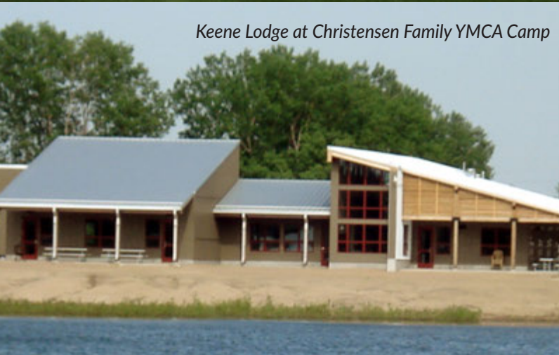
Keene Lodge at Christensen Family YMCA Camp

At the close of the trust in 2005, the farmland was sold and the proceeds used to establish the Hazel R. Keene Donor-Advised Fund at the Fremont Area Community Foundation. During the next decade, the fund grew by 5 percent and generated nearly $4.3 million in grants, which were awarded to charitable projects and nonprofit organizations throughout the Fremont area.