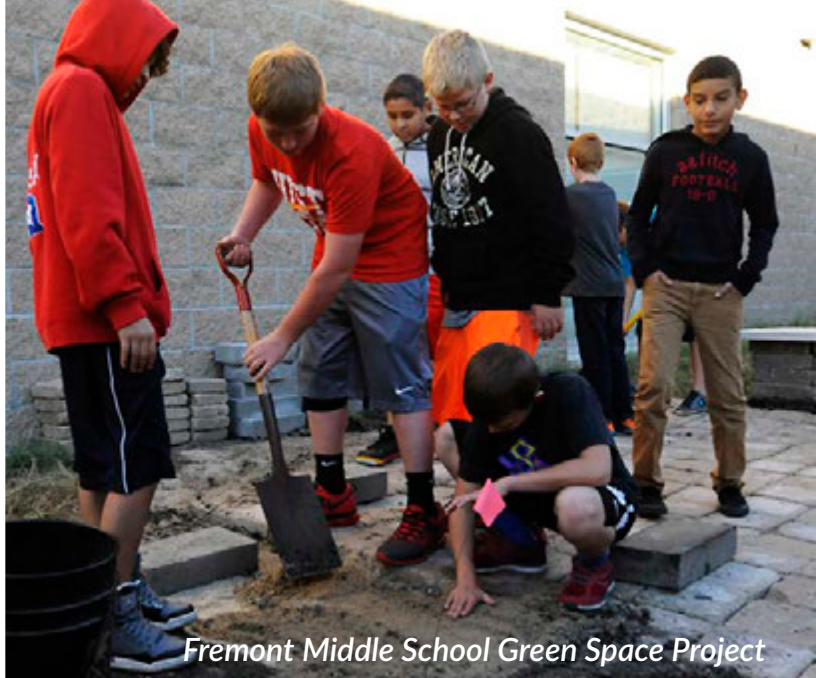
Fremont Middle School Green Space Project