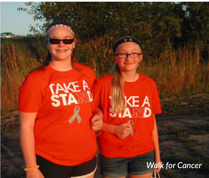
Walk for Cancer