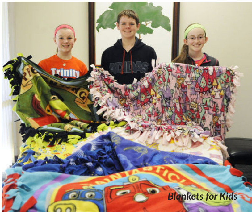
Blankets for Kids