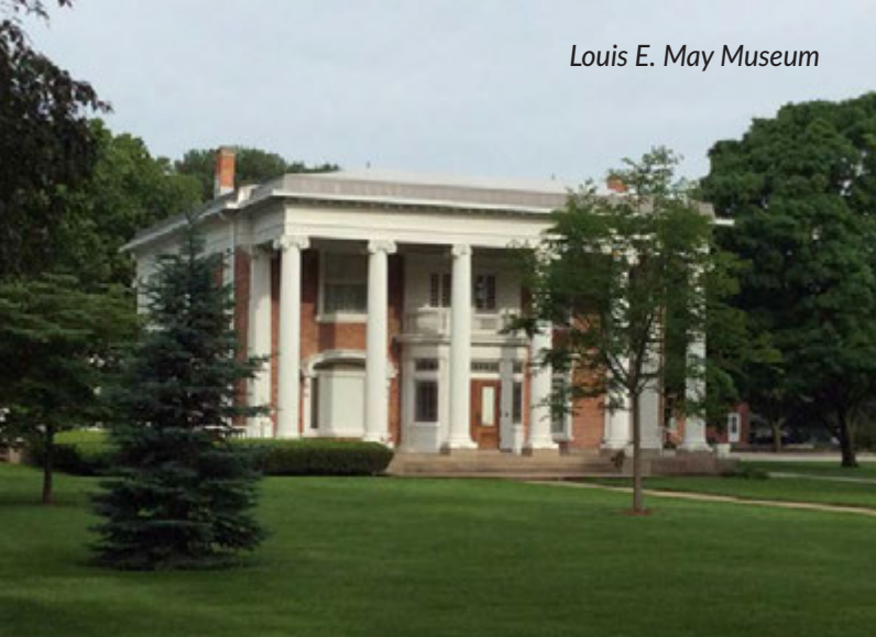
Louis E. May Museum