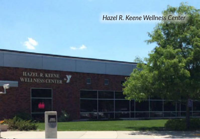
Hazel R. Keene Wellness Center

to name just a few. A significant project was Fremont's Keene Memorial Library. In addition to donating a large sum for the building, she was also active in the fund drive that eventually raised the balance of funds needed.