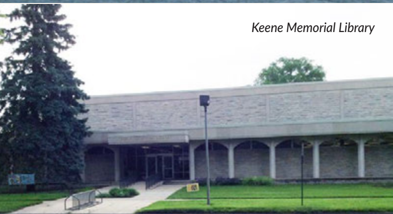
Keene Memorial Library