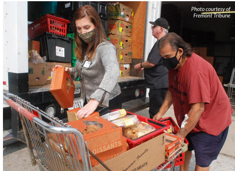
Two grants to the Care Corps' LifeHouse food pantry this year boosted food security for families throughout Dodge County.

Greater Fremont Development Council —$2,730 to support a Housing Study Update.