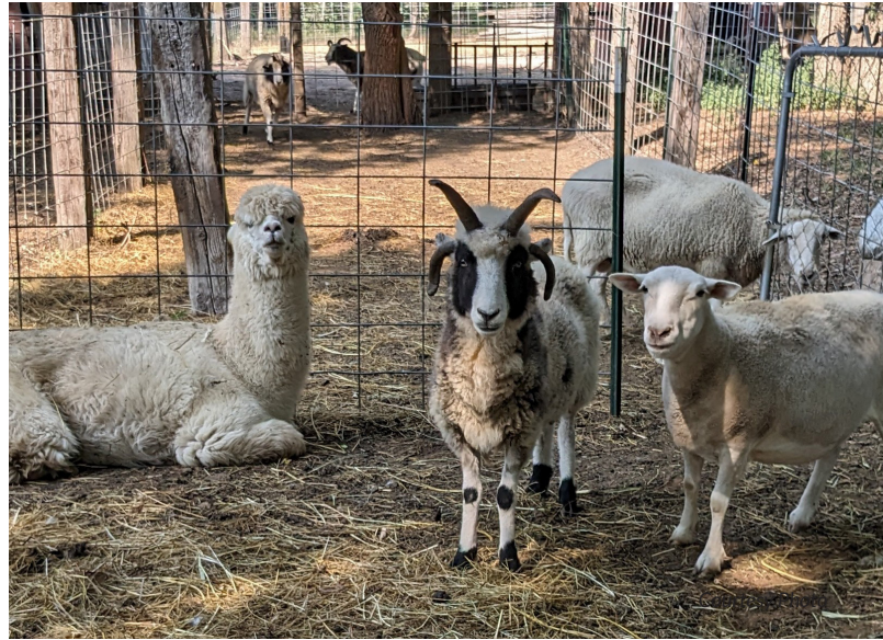
An FAFAC grant helped refurbish fencing, pens and roofing at the Old Poor Farm north of Fremont. Enjoying the improved facilities are residents Lily (the alpaca), Brock (the horned sheep), and Mary (the white sheep).

Logan View Public Schools —$3,854 to help provide transportation for the National WWI High School Junior field trip.