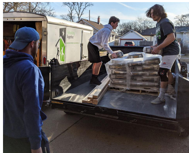
Volunteers are the lifeblood of Rebuilding Together, Platte Valley East, lending essential carpentry skills, handyman support, site assistance or hospitality.

Dozens of area individuals and families are now able to enjoy their safe and healthy homes, including elderly citizens who are happy to be able to “age in place.”