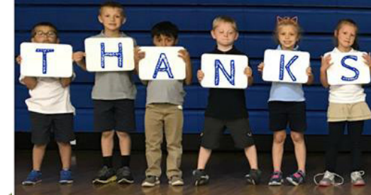
Trinity Lutheran School raised $4,372 during the 2018 Big Give to help purchase Chromebooks for its third grade students.

MEDIA SPONSORS Fremont Tribune KHUB-KFMT Radio